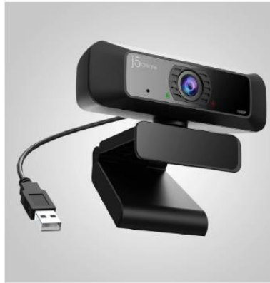
Standard UVC/UAC Protocol